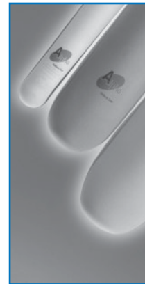
Liners help protect tissue from friction

Sockets and Liners —Because sores and infection occur so frequently in insensate limbs, sockets and liners are key determinants of prosthetic success. Flexible, dynamic sockets expand and contract with the musculature of the limb, preventing undue pressure over sensitive skin or nerve areas and bony prominences. Silicone and urethane gel sockets and liners can reduce friction and skin irritation and increase tolerance for the forces exerted within the socket. Many of