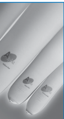
ect residual limb and irritation. Willow Wood.

For additional information, give us a call.