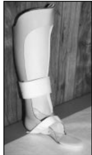
Floor reaction AFO helps control knee instability.

Mild involvement with no spasticity may call for a relatively simple flexible AFO incorporating dorsiflexion-assist to counter dropfoot. At the opposite extreme, patients with moderate-to-severe involvement may need a KAFO with knee locks or perhaps a rigid AFO incorporating rotational control and a floor reaction moment to enhance knee stability. For patients with residual spasticity, neurophysiological features, such as found in a dynamic ankle-foot orthosis (DAFO) or supramalleolar orthosis, can be incorporated to stimulate reflexes antagonistic to spastic movements.