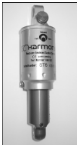
Harmony vacuum cylinder

Another approach developed by a leading liner innovator offers a less-intrusive solution. The Harmony Vacuum-Assisted Socket System employs a vacuum pump actuated by amputee ambulation to maintain an elevated vacuum between the liner and socket wall, which promotes natural fluid exchange and thereby minimizes residual limb volume loss.