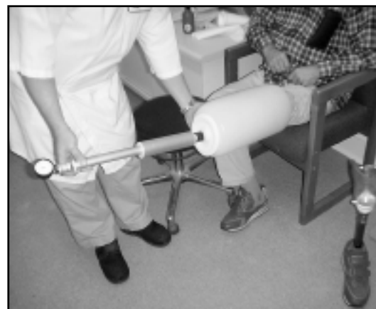
Ossur ICECAST compression casting bladder

able fit due to nearly equal force distribution across the residual limb, and the security of distal suspension. It has been shown to be a good choice for some patients with pronounced bony prominences in their residual limb.