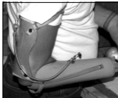
Transradial body-powered prosthesis.

Transhumeral —The addition of an elbow joint adds to the complexity of the prosthesis. The most common approach is to incorporate a second, independent control cable to lock and unlock the elbow unit. In such an arrangement, movement of the primary cable while the elbow is unlocked generates elbow flexion/extension. Once the lock is actuated by secondary cable action, further primary cable travel is transferred to actuate the terminal device. In special designs, the lock may be actuated by movement of residual limb muscles.