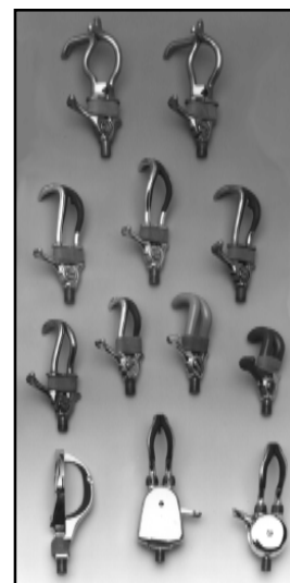
A wide selection of hook designs and sizes is available.

The Hosmer Driving Ring , for example, attaches easily to steering wheels of automobiles, boats and aircraft, providing a sure connection seldom achieved with a standard hook or hand.