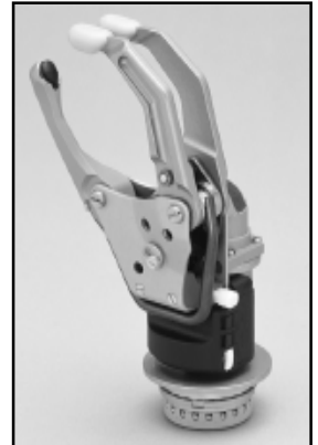
Otto Bock SensorHand (see page 4)

Many upper-limb prostheses are suspended by a combination of intimate socket fit and a strategically positioned upper-body harness, which in body-powered systems also anchors the cable(s) control-